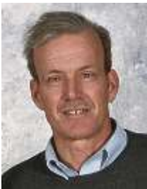
Central District (5) Director