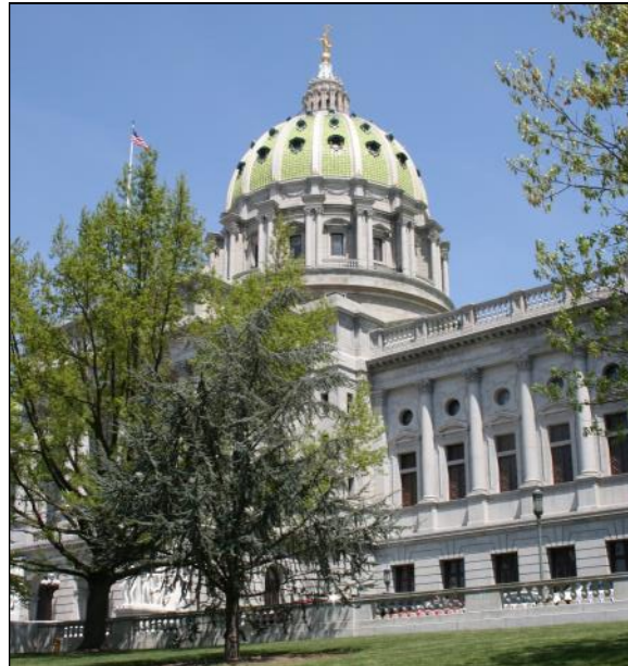
Pennsylvania State Capitol, Harrisburg, PA

➤ ➤ ➤ Pennsylvania Manufactured Housing Political Action Committee